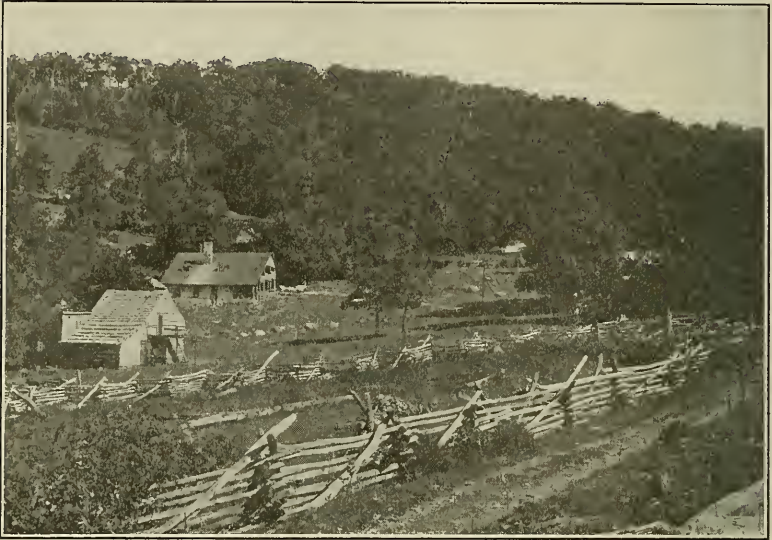
FIG. 1. Apple Orchard Camp, Virginia.

reach of comfortable quarters. Add to this the fact that Apple Orchard is practically unknown to botanists and that the whole region around the camp is a veritable flower-garden from about May 20 to the end of June, while Rhododendron catawbiense and Kalmia latifolia are in bloom, and the attraction is well-nigh irresistible.